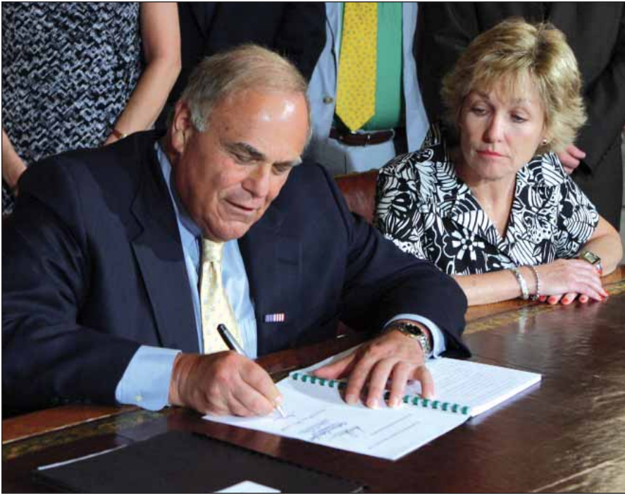
The Governor signs Senator Earll's tax measure, Senate Bill 1063, into law on July 2, 2008.