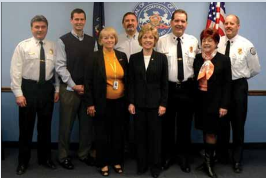
Erie firefighters and staff of the Safe Kids Coalition

There is nothing more important than the safety of your family. That is why I helped the Erie Fire Department and Safe Kids Erie Coalition secure a grant through DCED. The grant money will help the "Protect the Place You Call Home" program distribute and install free smoke alarms, as well as provide fire safety education to Erie County residents. Applications are available through the City of Erie Fire Department by calling 870-1402.