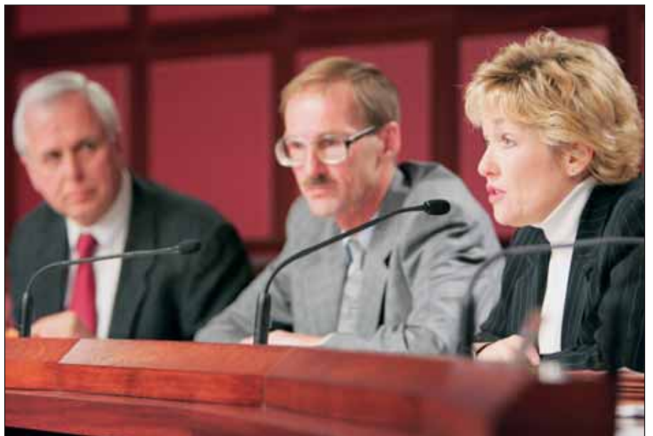
Senator Earll discusses surrogate parenting legislation at a public hearing of the Senate Judiciary Committee.

I've introduced Senate Bill 408 to establish rules and guidelines to produce informed and voluntary decision making, and ensure that children born under surrogate parenting agreement have a permanent home.